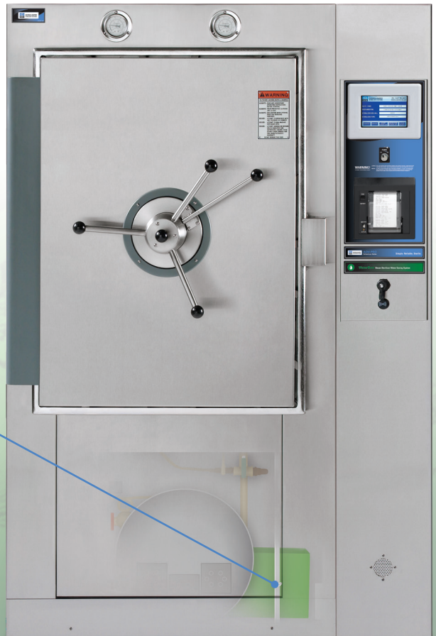
Model SR-24C-ADV-PRO equipped with WaterEco® System

The WaterEco® system is a patented, innovative device that easily incorporates into new sterilizers or can be retrofitted to existing systems.