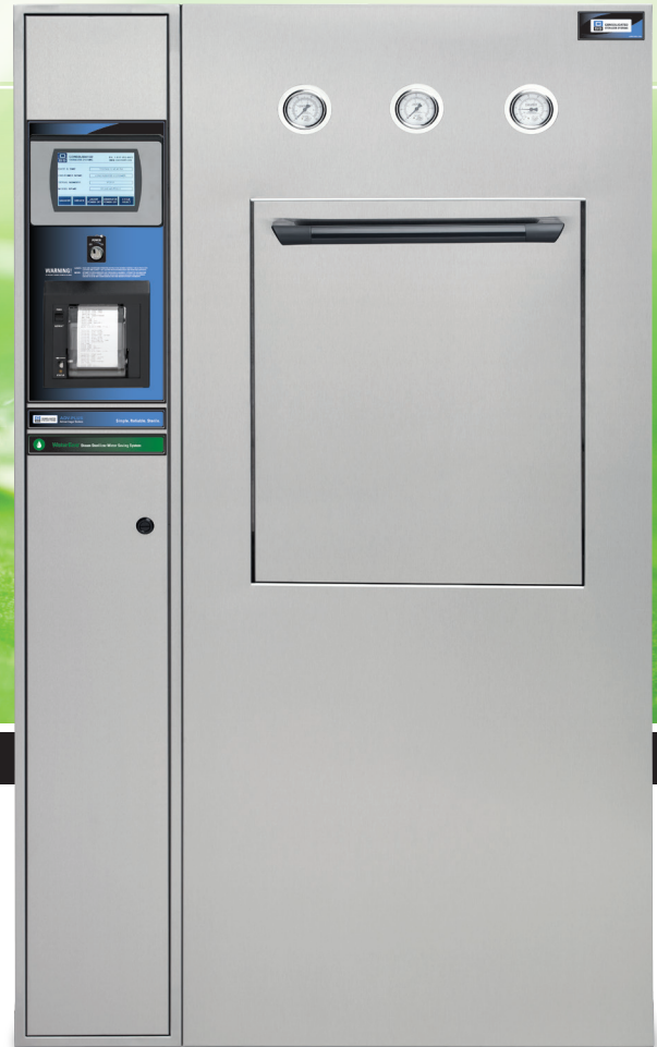
Model 3AV-ADV-PLUS Sliding Door Sterilizer with Consolidated WaterEco® Water Saving System